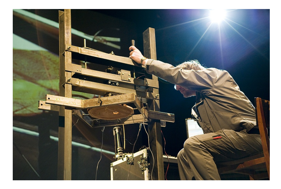
Figure 1: scratching wood (foto; myro myska)

The woodscratcher is a composition and sound generating machine, which cuts a 2-5~cm thick disk of a wooden trunk in a circular line along the growth rings of the wood. The disc is sensored with 4 pickup microphones on 4 sides, playing this signals over 4 speakers in the corner of the room, which spans acoustically the slice wood spatialized over the room. This scratching in the concert is done until the inner part of the disk falls to the ground and the piece ends.