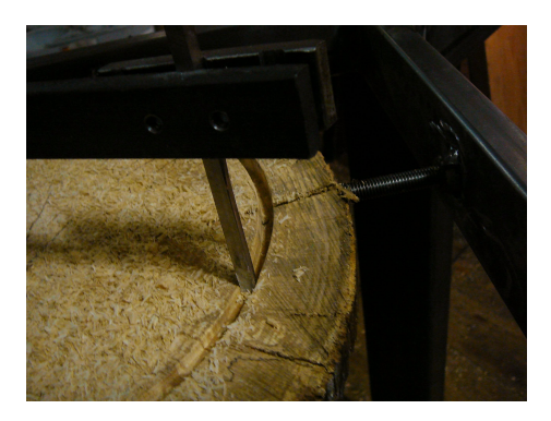
Figure 2: Scracthing process